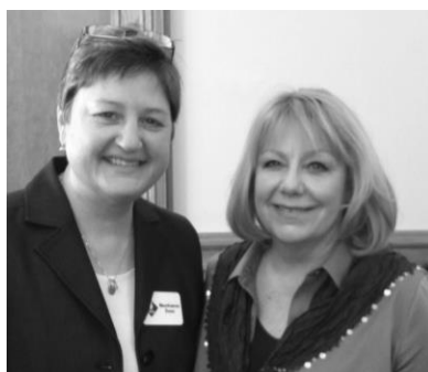
Maryfrances and Senator Pam Jochum (District 14).