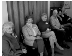
A lovely crowd at the KWTI studios