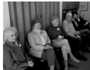
A lovely crowd at the KWT studios